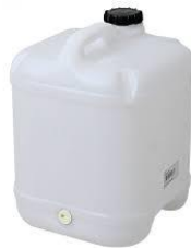
15/20L Cube container